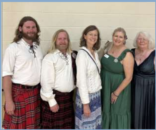
Charleston dancers at Loch Norma